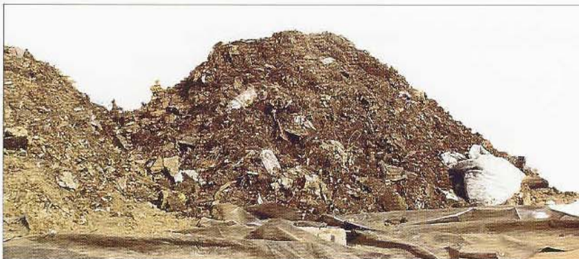
Captured debris from FloGard+PLUS, Dana Point, CA