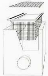
FloGard+PLUS Flat Grate